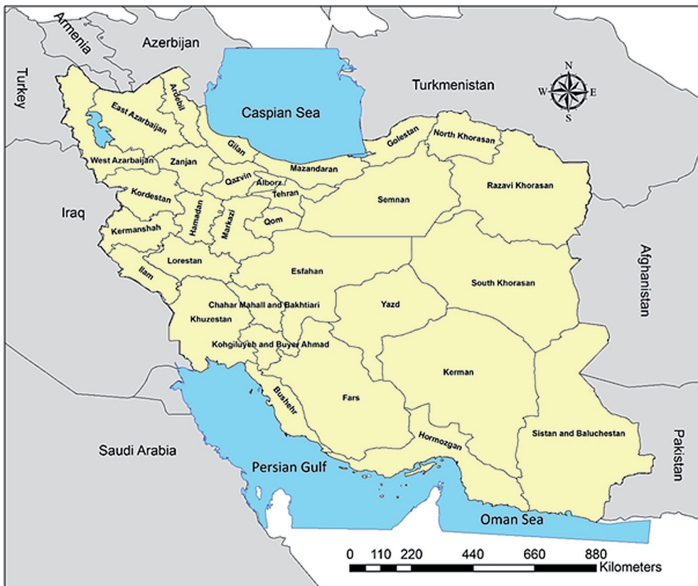
Figure 1. Map of Iran and its 31 provinces.

distributional records in the region or possible new data in Iran. Maes et al. (2018) was consulted for the latest classification of arboviruses of the order Bunyvirales. The capital letter abbreviations used for the names of viruses are based on the “International catalog of arboviruses including certain other viruses of vertebrates” (available at https://wwwn.cdc.gov/arbocat/VirusBrowser.aspx ). There is one exception: all sandfly-borne phleboviruses were mentioned in one keyword “Sandfly fever”. Those are abbreviated SFN-SV because the most common viruses among them are Naples (SFNV) and Sicilian (SFSV) viruses, and also to distinguish them from Semliki Forest virus (SFV). Also, sheep pox virus (SPV) and goat pox virus (GPV) were mentioned in one search result. Though they are different viruses, their clinical diseases are similar. The abbreviations of mosquito and sandfly genera and subgenera follow Reinert (2009) and Galati et al. (2017), respectively. For the valid species names of different arthropod taxa, the following references and webpages were consulted: biting midges (Borkent, Dominiak, 2020), horseflies (Moucha, 1976), mosquitoes (Azari-Hamidian et al., 2019, 2020; Harbach, 2023), sandflies (Secombe et al., 1993) and ticks (Gugliemone et al., 2010, 2014; Hosseni-Chegeni et al., 2019).