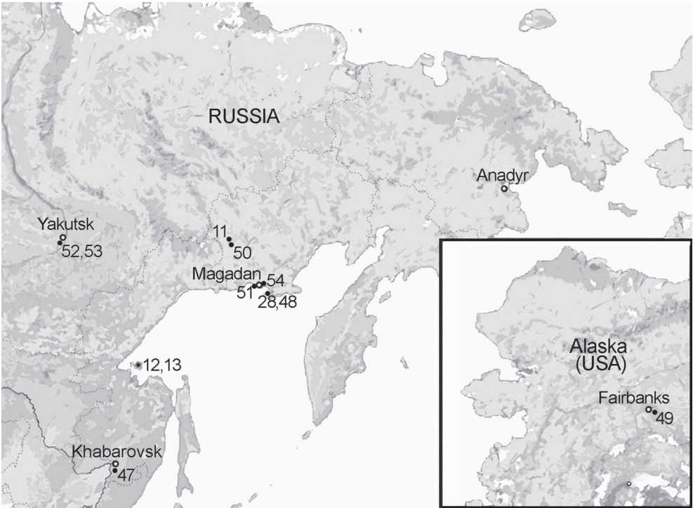
Figure 1. Collection sites for intermediate hosts of Mesocestoides . The numbers correspond to the sample numbers from Table 1.

Tetrathyridia samples were obtained as a result of theriological studies of rodents and insectivores conducted by N.E. Dokuchaev in 2002–2019; small mammal collection sites are shown in Fig. 1 and Table 1.