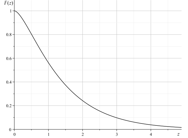
Fig. 1. Graph \mathcal{F}(z)