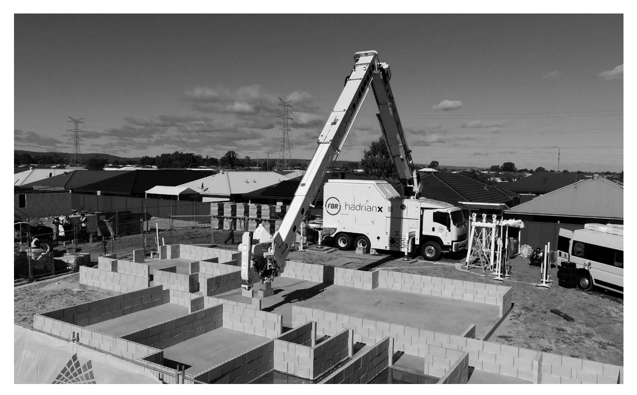
Fig. 5. Hadrian X. construction robot