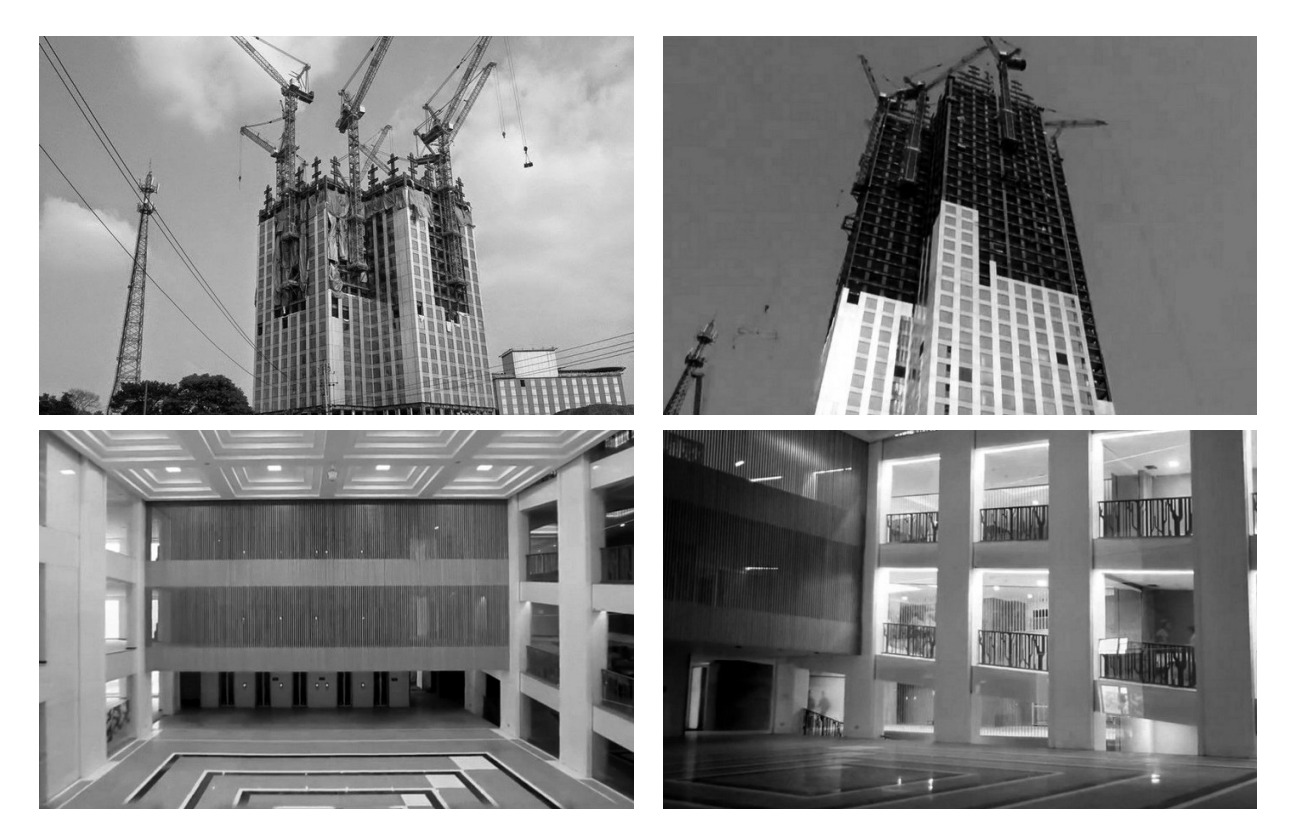
Fig. 1. The Mini Sky City skyscraper, China