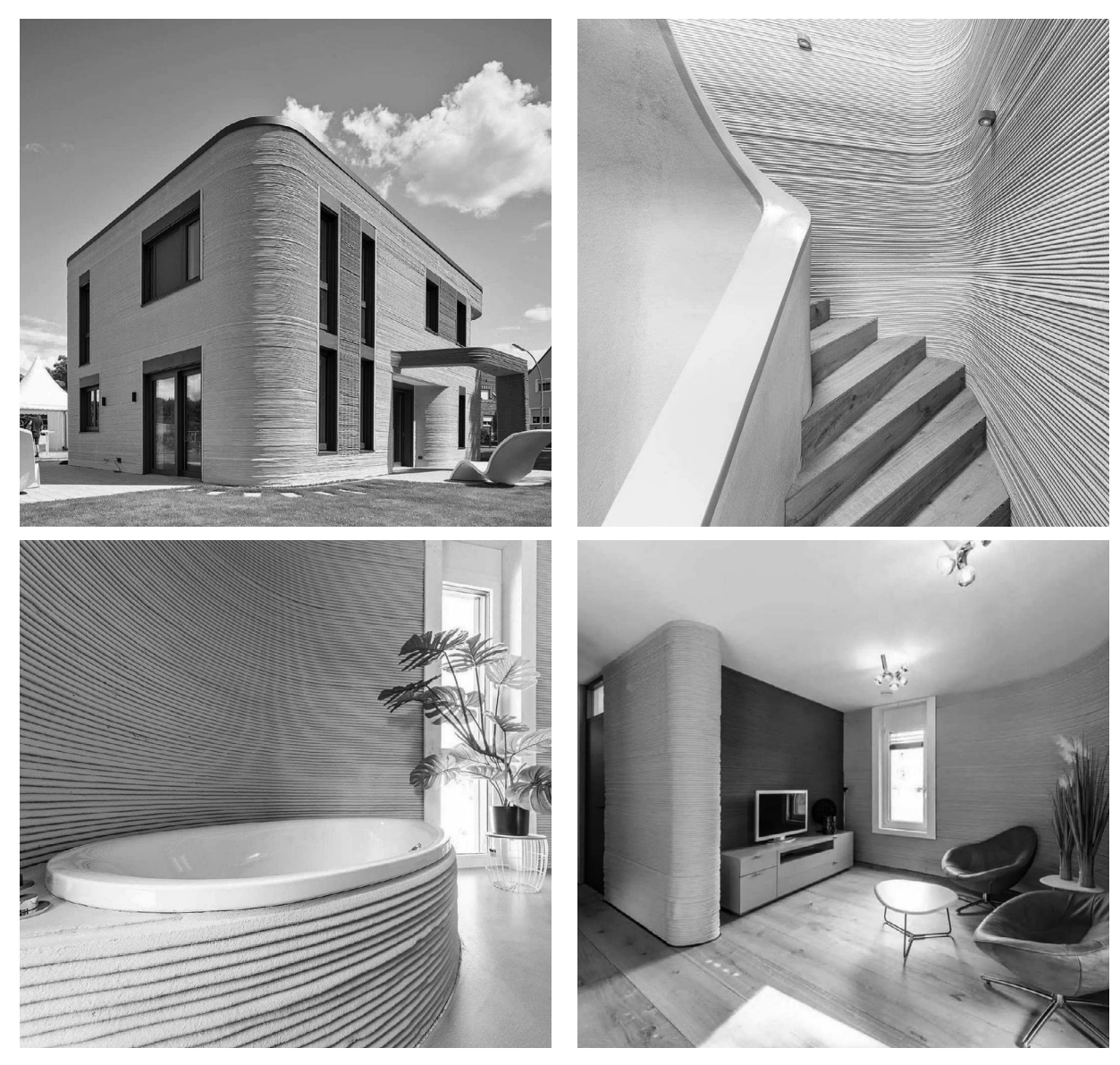
Fig. 3. The residential building construction with 3D printer, Germany