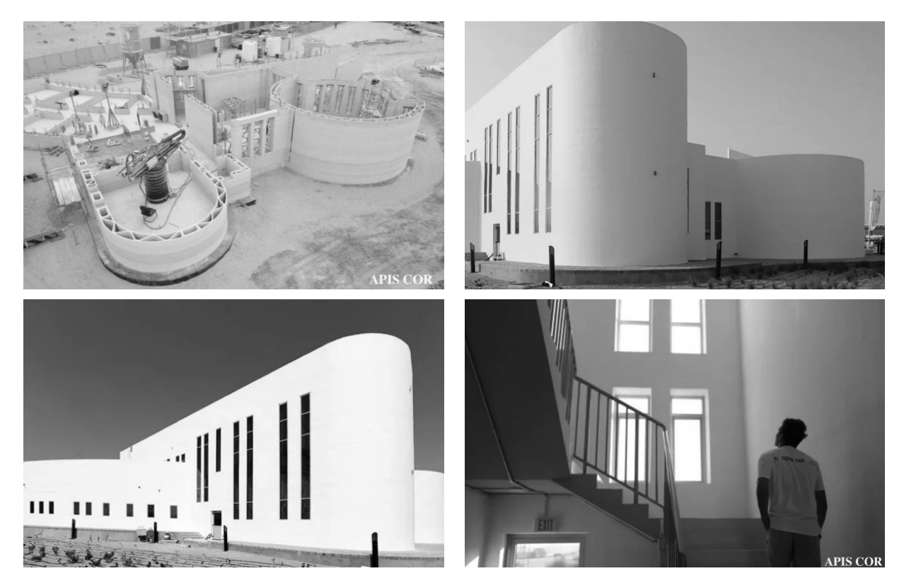
Fig. 2. The two-story building using 3D printing, Dubai