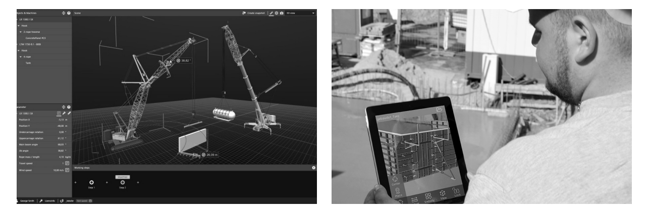
Fig. 7. Crane Planner software and the planitec AR app