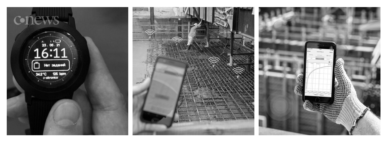
Fig. 4. Smart Sensors and gadget in construction